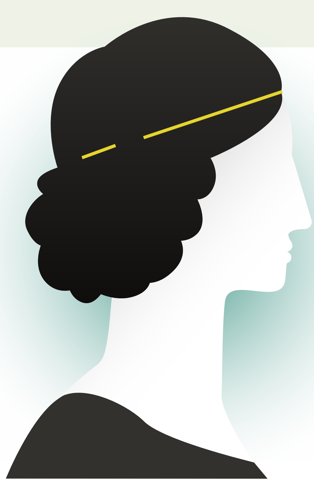
MARY SHELLEY 1797-1851

Mary Shelley's age when Frankenstein was published